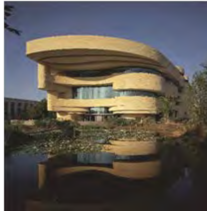
National Museum of the American Indian