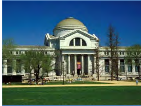
National Museum of Natural History