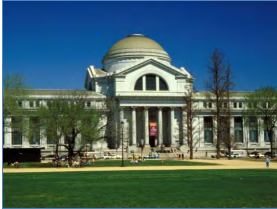
National Museum of Natural History